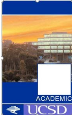
Legacy Academic Card