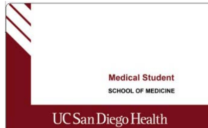
Medical Student One Card