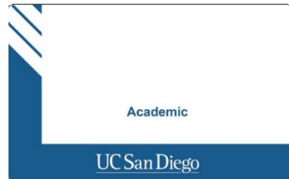
Academic One Card

For those who need a new or replacement ID card, please visit: