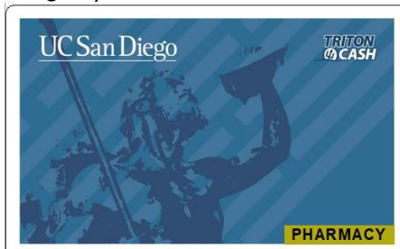
Legacy Pharmacy Student Card