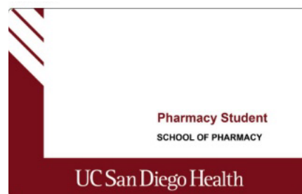
Pharmacy Student One Card