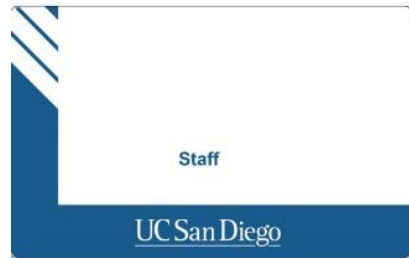
Staff One Card