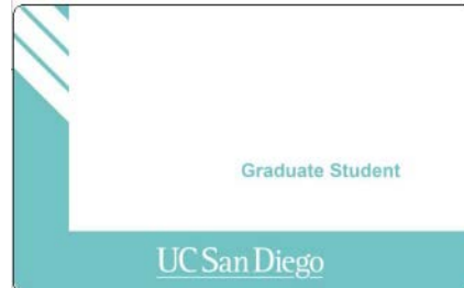
Graduate Student One Card