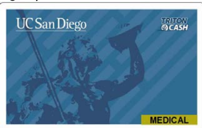
Legacy Medical Student Card