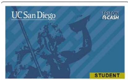
Legacy Undergraduate Student Card