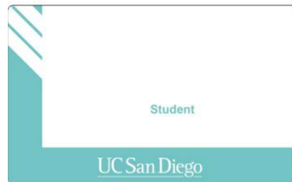
Undergraduate Student One Card