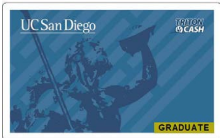
Legacy Graduate Student Card